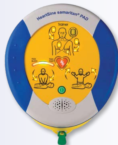
samaritan PAD 450P Trainer with CPR Rate Advisor Simulation (TRN-450-xx)