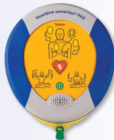
samaritan PAD 350P Trainer (TRN-350-xx)